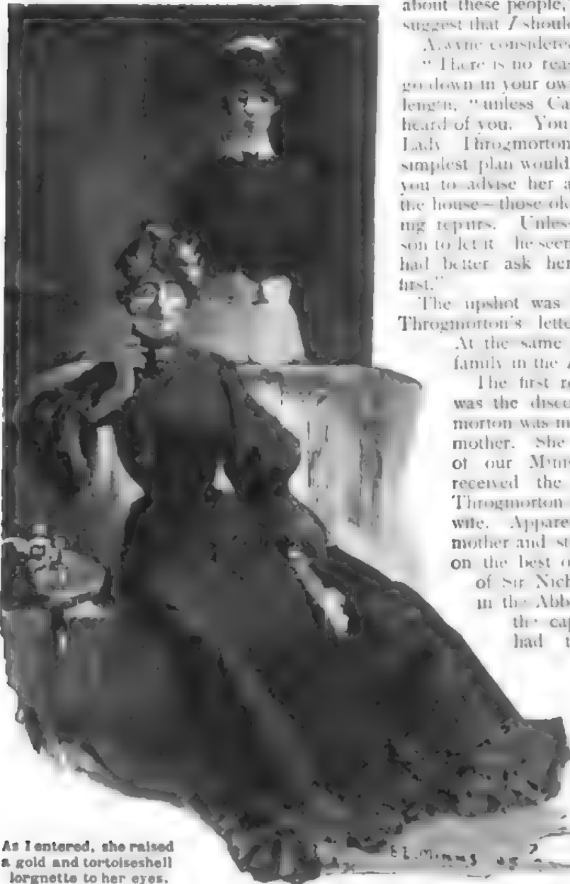
As I entered, she raised a gold and tortoiseshell lorgnette to her eyes.

show the cloven hoof like that I shall look out for some kind, good-natured husband who will not trample on me. But there is no need that I should take a false name, or do anything else that you don't like. Why shouldn't this lady advertise for a companion in the Standard , and I answer the advertisement, and go down on trial?"